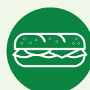
Sandwiches (& Cheesesteaks)