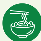
Asian Rice/ Noodle Dishes