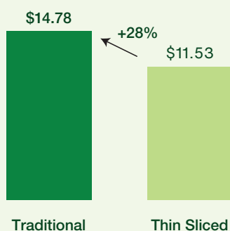
Average Price Per Unit

Amid inflation, Thin Sliced Steak offers lower unit pricing for shoppers, leading to greater segment growth.