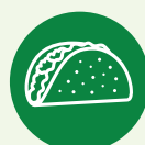
Tacos & Fajitas (including Sabana De Res & Carne Asada)