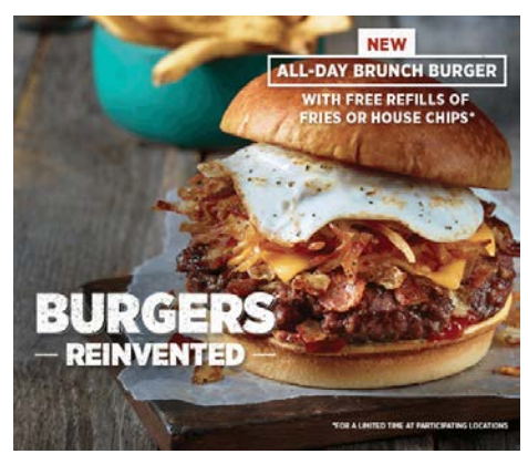
Applebee's All-Day Brunch Burger