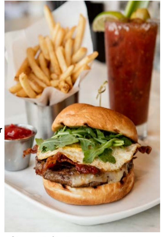
Slaters 50/50 French Toast Benny Burger

French toast, pancakes, waffles and potato dishes stand out as the leading breakfast fare at nontraditional hours (following eggs).