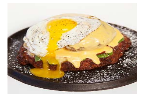
Brio Brunch Burger