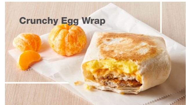
Crunchy Egg Wrap