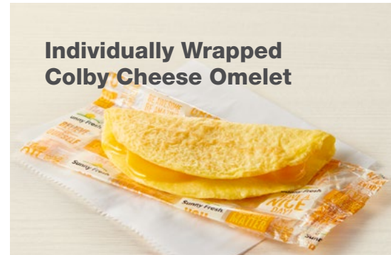
Individually Wrapped Colby Cheese Omelet